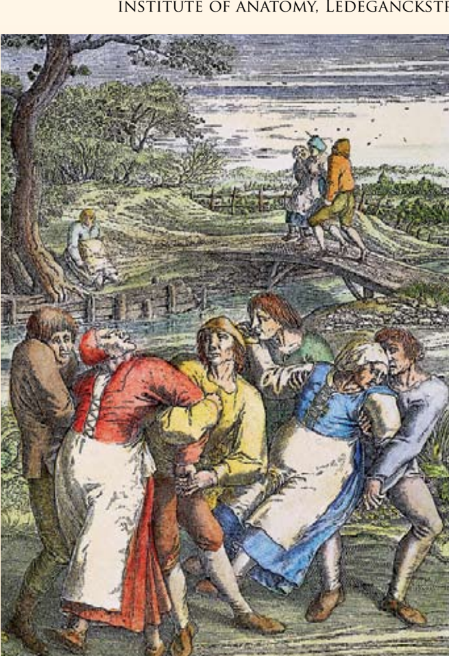
"Pilgrimage of the Epileptics to the chapel and bridge at Molenbeek", by Pieter Breughel the Younger, 16th century, reproduced by Hendricus Hondius on colored copper engraving (1642)

institute of anatomy, Ledeganckstraat 35, B-9000 Ghent, Belgium