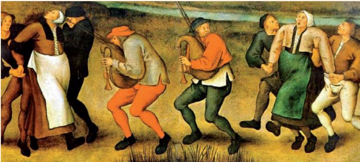
"PILGRIMAGE OF THE EPILEPTICS TO THE CHURCH AT MOLENBEEK", BY PIETER BREUGHEL THE YOUNGER, 16TH CENTURY